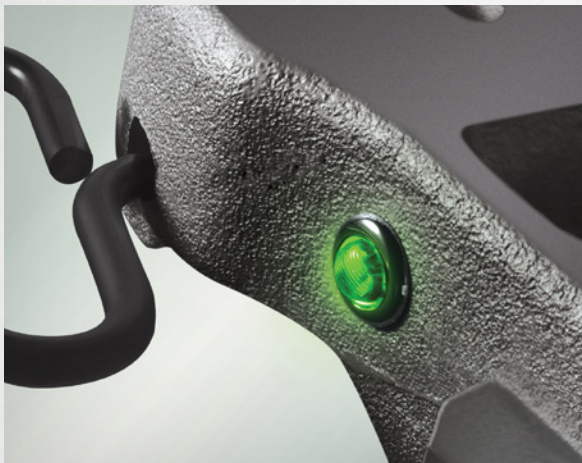
CAPTION: SmartConnect® provides an additional check to supplement the DOT-required visual inspection and tug test. A green light informs the driver that the fifth wheel is securely locked. If the light flashes before turning solid green it signals that an adjustment or repairs are needed at the next service interval. On the other hand, a red light indicates an unlocked state, prompting the driver to ensure proper re-coupling before proceeding on the road.