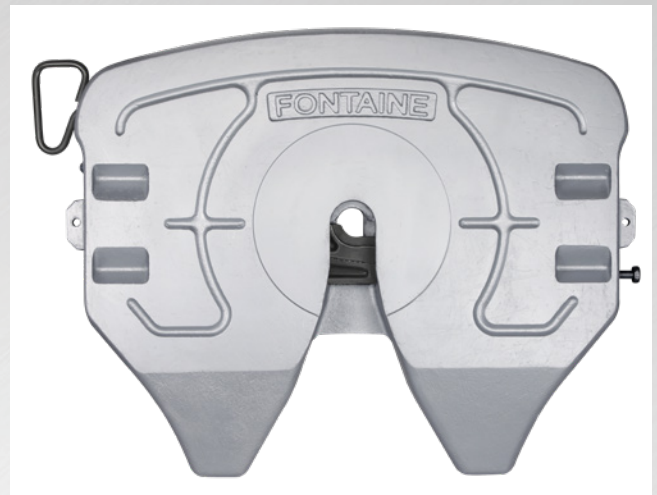
See page 2 for photo captions and images available for publication at www.fifthwheel.com/press

Media Contact: Brian Bowen bbowen@fifthwheel.com 205-847-3251