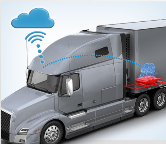
CAPTION: When integrated with the Truck OEM's CAN and telematics systems, SmartConnect® will seamlessly transmit lock status, hours of use, number of couples and maintenance alerts to fleet managers. The SmartConnect® brain features hardwire connections for future fleet management communication and software enhancements which are underway.

Media Contact: Brian Bowen bbowen@fifthwheel.com 205-847-3251